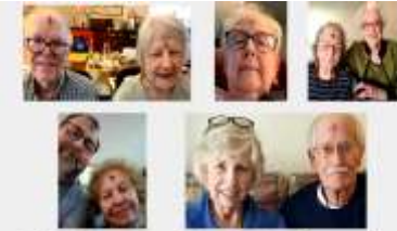
The Faces of Ash Wednesday

Ash Wednesday marks the beginning of Lent. It is the day that we remember our mortality, repent of our sins and begin the preparation of our hearts and minds as we travel the six weeks of Lent toward Easter. Please plan to attend one of our two services: 12:00 pm in the Chapel or 6:00 pm in the sanctuary, Give thanks to Christ for his mercy and grace and leave your burdens with him. The imposition of ashes will be offered in both services.