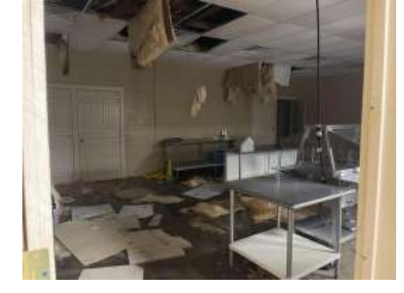
Camp Tanako suffered damage to the kitchen when pipes burst due to the freezing temperatures. (pictured above)

Damage was felt locally when straight line winds took lown trees and power lines, earlier in the month, causing damage to homes on the South side of Pine Bluff.