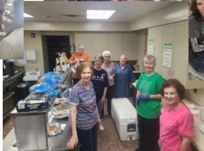
Project Transformation Family Fun Night 2024